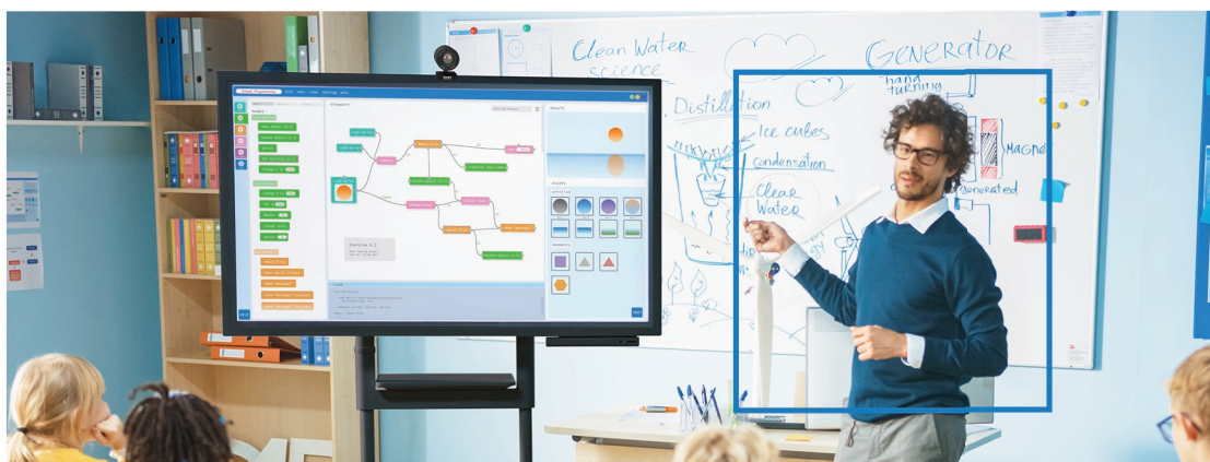
E-pan, tilt and zoom to customize view

Built-in two mics that picks up your voice clearly up to 4-meters, with noise-cancelling (ANS) to reduce background distractions.