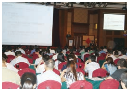
Supplier briefing session in China

In fiscal 2014, Konica Minolta will establish a Conflict Minerals Compliance Policy and continue to enhance its initiatives.